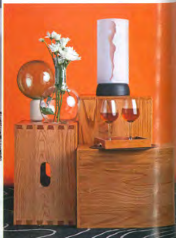
(THIS PAGE - LEFT) Black side table, ₹29,900; Cream box (small), ₹7,200; both from Mozaic. Ingrid black and white carpet, ₹1,00,500, Shyam Ahuja. Dresses, Stylist's own. (THIS PAGE - RIGHT) Crystal ball, Miss light lamp; Tabourets boxes; all prices on request, all from Poltrona Frau Group Design Center. Mekalu rug, price on request, Jaipur Rugs. (FACING PAGE) Vellero bookcase; Fred desk, Vanity fair miniature; Chain lamp; Caprice chair; Crystal ball; all prices on request; all from Poltrona Frau Group Design Center. Mukul Goyal pen holder, ₹2,810; Mukul Goyal tape dispenser, ₹3,150; both from Santorini. Makalu rug, price on request, Jaipur Rugs. SET UP AT POLTRONA FRAU GROUP DESIGN CENTER

It's one thing to hide away your clutter. But why should you have to hide the storage too? Small storage that's as stylish as it is functional can easily share shelf space with your favorite things. Create an interesting display or use them as makeshift stools. Well, it could also moonlight as your centretable or bar unit.